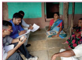
Survey in Tuljapur