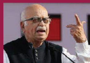
Lal Krishna Advani Former Deputy Prime Minister of Bharat