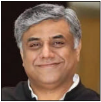
Dr. Rajiv Gowda Former Member, Rajya Sabha