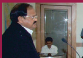
M. Venkaiah Naidu Former Vice-President of Bharat

Around 350 national level leaders from Political, Social, Bureaucracy, Judiciary, Media & Corporate sector have interacted with participants since the inception of MPG program.