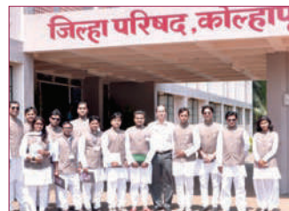
Kolhapur Zilla Parishad