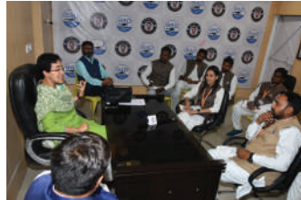
Atishi Marlena Hon'ble Chief Minister of Delhi