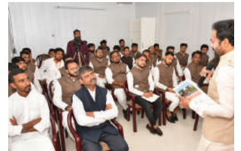
G Kishan Reddy Hon'ble Minister of Coal & Minister of Mines, Govt. of Bharat