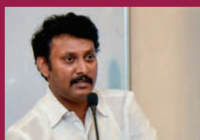
Anbil Mahesh Poyyamozhi Minister of Primary Education, Tamil Nadu