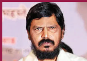
Ramdas Athawale Union Minister of State for Social Justice and Empowerment