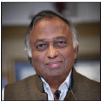
Dr. Vijay Bhatkar Padma Bhushan, Ex-Chancellor, Nalanda University