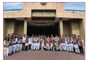
Madhya Pradesh Assembly Election