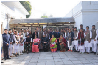
Sharad Pawar President, NCP-SP