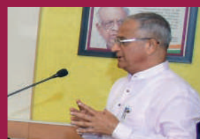
Ganesh Karnik Former MLC, Karnataka Legislative Assembly