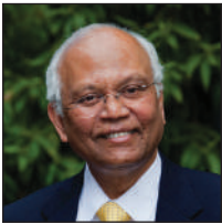
Dr. Raghunath A. Mashelkar Padma Vibhushan, Renowned Scientist