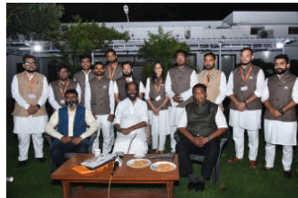
Tiruchi Siva Member Rajya Sabha, Tamil Nadu