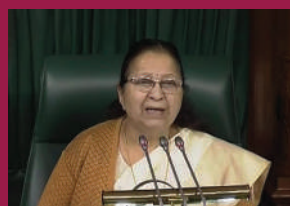
Sumitra Mahajan Former Speaker, Lok Sabha