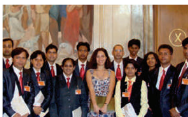
World Trade Organization (WTO), Geneva