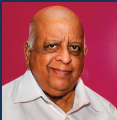
A True Personification of Honesty, Integrity & Dignity