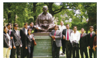
Indian Embassy, Berne