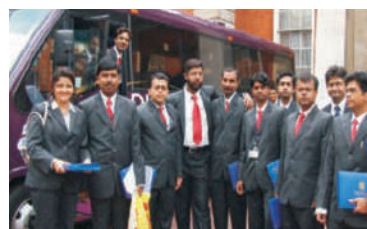
Commonwealth Secretariat, London