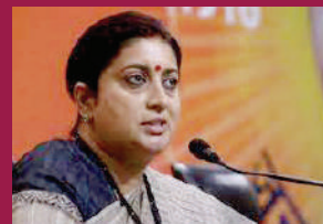
Smriti Irani Former Minister of Education, Bharat