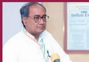
Digvijay Singh Former Chief Minister of Madhya Pradesh