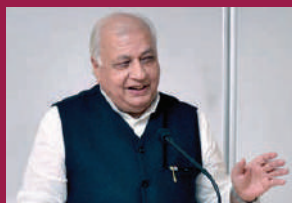
Arif Mohammad Khan Governor of Kerala