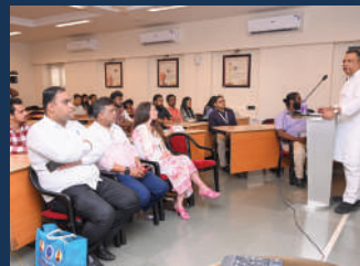
Seminar & Conferences