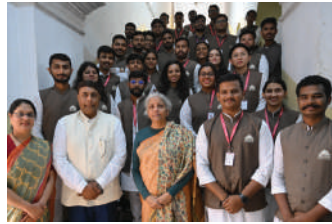
Nirmala Sitaraman Hon'ble Finance Minister, Govt. of Bharat