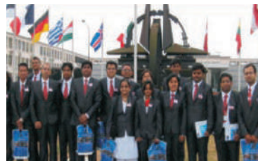
North Atlantic Treaty Organisation (NATO), Brussels