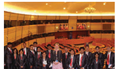
European Parliament, Brussels