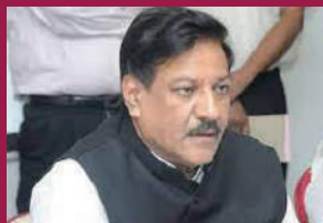
Prithviraj Chavan Former Chief Minister of Maharashtra