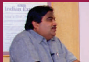
Nitin Gadkari Minister of Road Transport & Highways, Small & Medium Enterprises Ministry