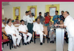
Sharad Pawar President NCP-SP