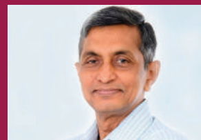
Dr. Jaiprakash Narayan Founder and President, Lok Satta Party