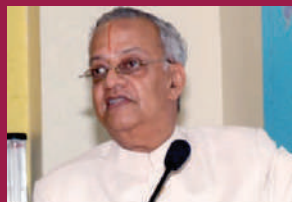
N. Gopalaswami Former Chief Election Commissioner of India (CEC). Padma Bhushan in 2015