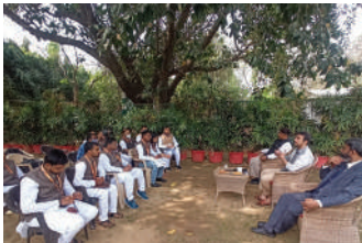
Jayant Choudhary Hon'ble Minister of Skill Development and Entrepreneurship, Govt. of Bharat