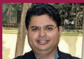
Abhishek Mishra Former Minister, Govt of Uttar Pradesh