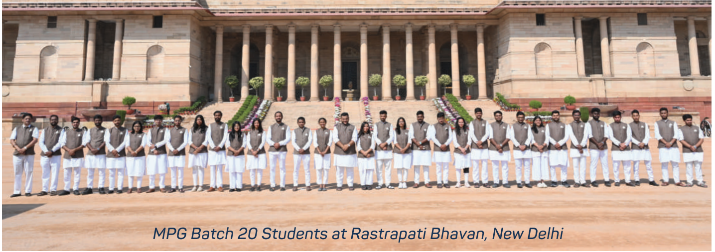
MPG Batch 20 Students at Rastrapati Bhavan, New Delhi