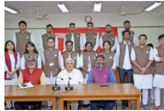
Prakash Karat Former General Secretary, CPI (M)