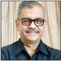
Adv. Ujjwal Nikam Eminent Lawyer & well-known Public Prosecutor