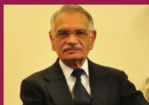
Shivraj Patil Former Speaker, Lok Sabha