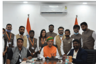
Arjun Ram Meghwal Hon'ble Minister of Law and Justice, Govt. of Bharat