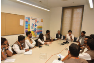
Tejasvi Surya Member Lok Sabha, Bangalore South, Karnataka