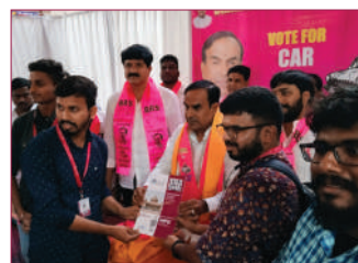
Telangana Assembly Election