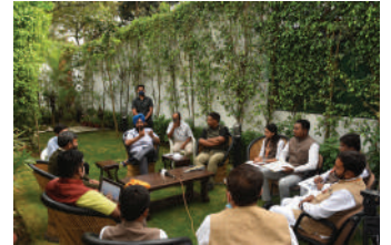
Pratap Singh Bajwa Leader of the Opposition, Punjab Legislative Assembly